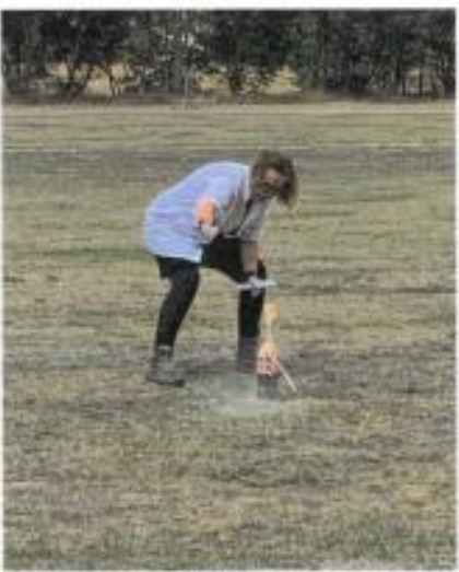
By: Cushla 3/4 L J