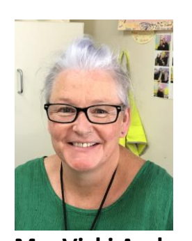
Year 5 /6 teacher