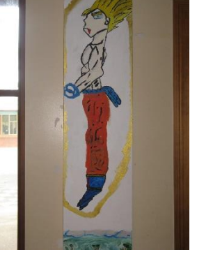
Year 3 /4LM students completing additional work within their Art lesson.