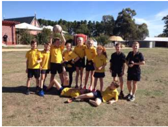
(some of our students are missing from the photos)

As usual the quality of play and team spirit is very high! Today's game was a 2-1 victory with a narrow win to The Barbies just seconds before the bell went!