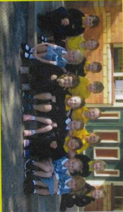
Grade 6 - 2024