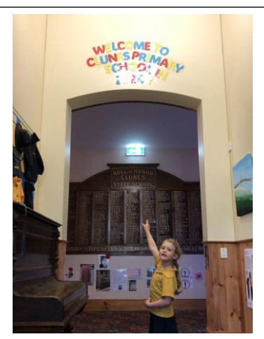
Elara – 1MJ pointing to our Welcome sign. 😊