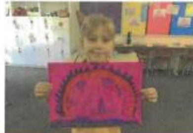
Making our Connection to Country posters.