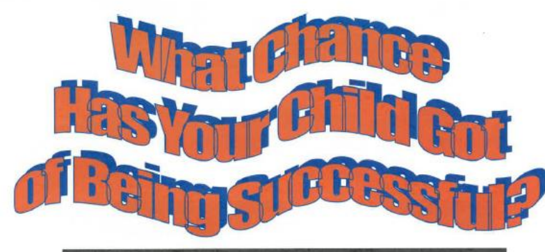
1 or 2 days a week doesn't seem much but......