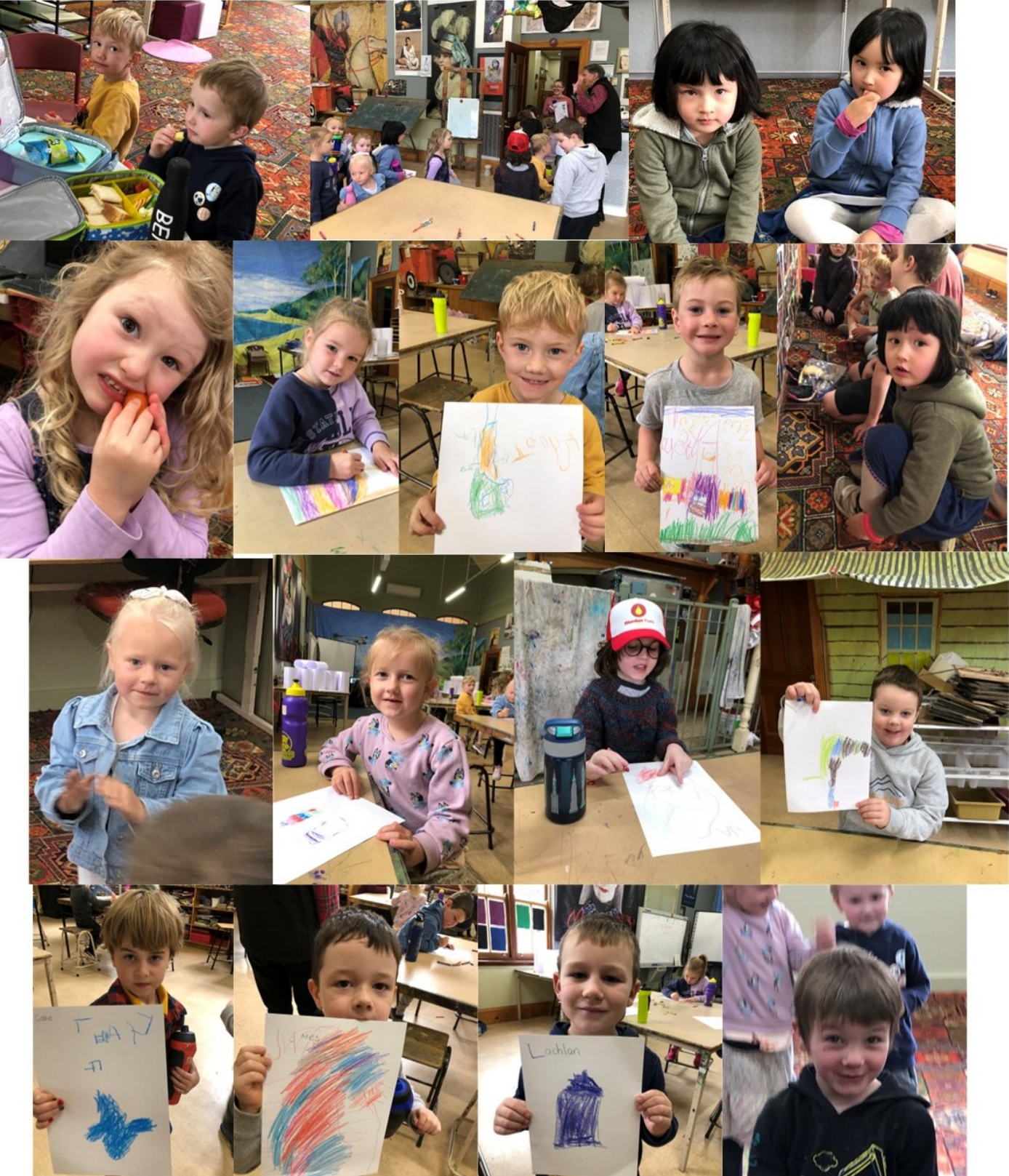
But wait... there's more! Please see more photos of our Prep D 2023 class over the page!