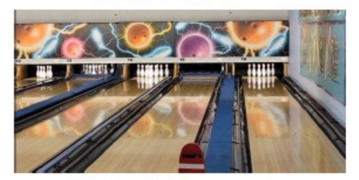
Oz Ten Pin Bowling Ballarat