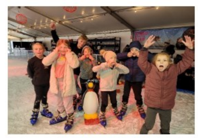
Ice Skating in Ballarat