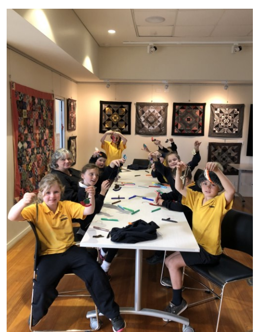
National Simultaneous Storytime 2022 Year 1 /2MJ at the Clunes Library – Wed 25/5