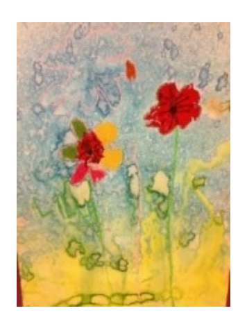
ANZAC Day Badges are available for sale at School. All proceeds go directly to the RSL.

Our School Captains and Vice—Captains will participate in the formal ceremony. A School Captain will read Stanza Three of the Ode and all four School Captains will lay a wreath on behalf of the school community. Selected pieces of student writing (senior school) will be read at the ceremony by the authors. The chosen pieces for 2022 will be determined by the staff at the end of this term. Selected pieces will be placed in the Term 2 Week 1 Newsletter.