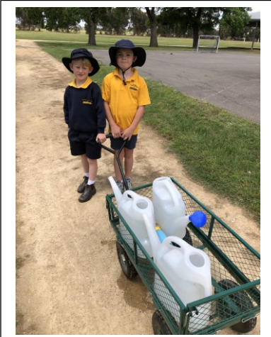
Hot days ahead! Watering our precious infant trees!

Sincere thanks to our Working Bee and daily student helpers! Every little bit helps! (only 3 families were able to attend the Working Bee)