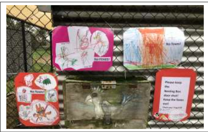
No foxes welcome at our school either! Keeping our chickens and ducks safe!