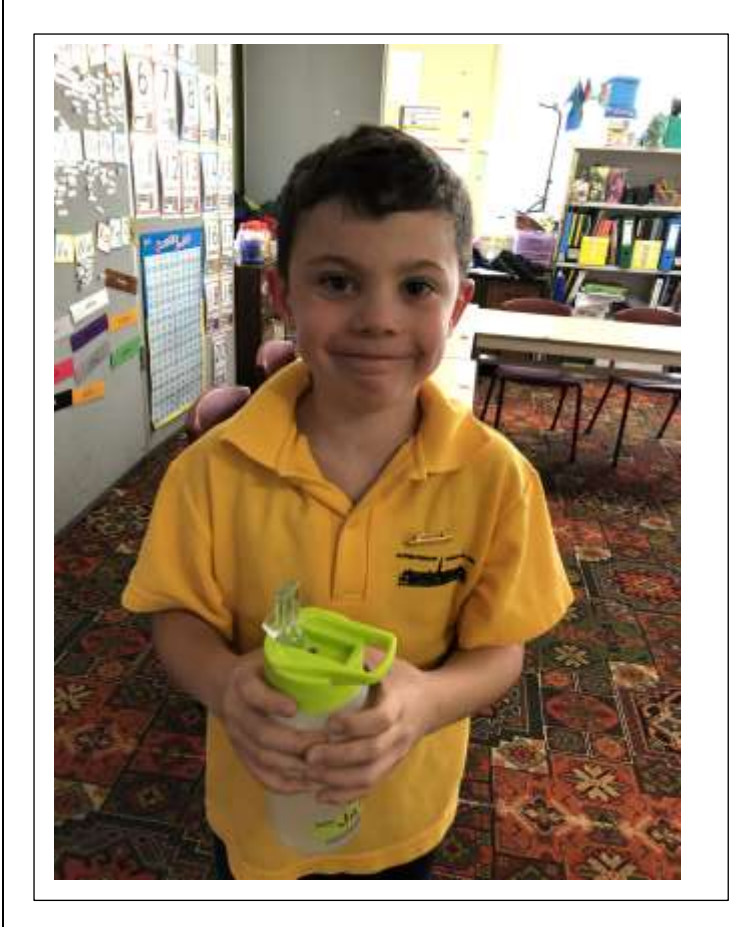
Thank you Central Highlands Water for our donated water bottles!