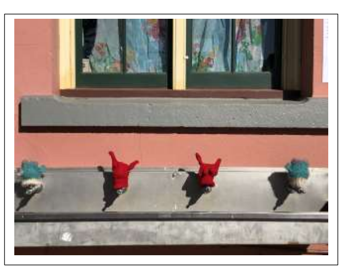
No drinking from the drinking fountains until further notice!