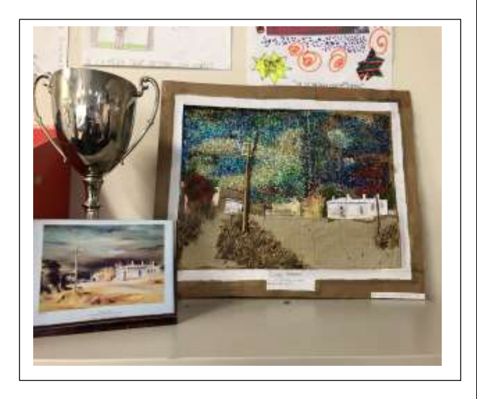
Isabell's 'Clunes Township'. A very impressive recreation.