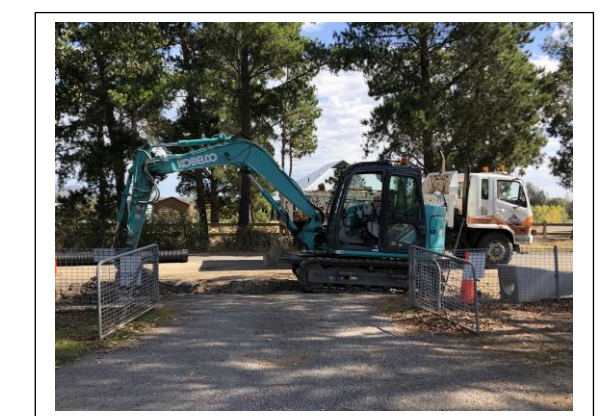
Paddock St., Canterbury St. and School Rd. Footpath and road upgrade

On April 1, Hepburn Shire contractors began the Canterbury St & School Rd footpath upgrade! This week our Parent/ Carers Parking Area has received a <u>significant</u> upgrade!