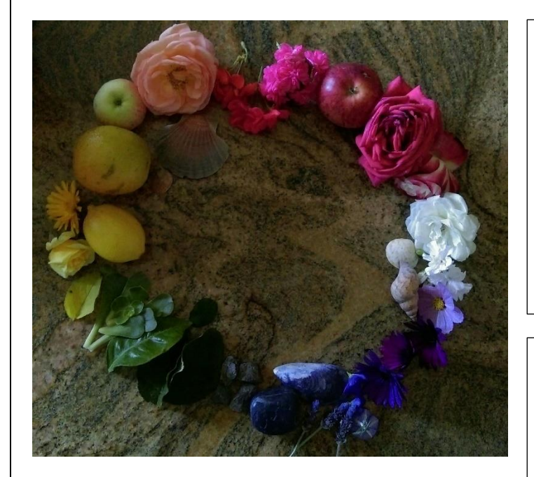
Lily R- Colour Wheel